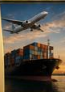
INTERNATIONAL TRADE SUPPORT