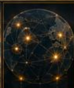
GLOBAL BANKING CONNECTIVITY