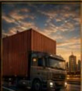
TRADE CORRIDORS WORLDWIDE